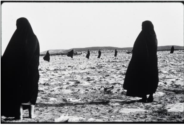
Shirin Neshat, Vervoering (still), zilveren prent op barietpapier, 1999